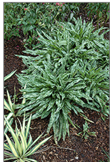
Cevennensis Lungwort