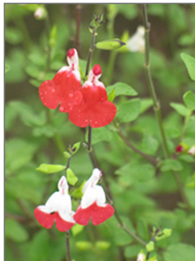
Little Kiss Sage flowers

Little Kiss Sage is recommended for the following landscape applications;