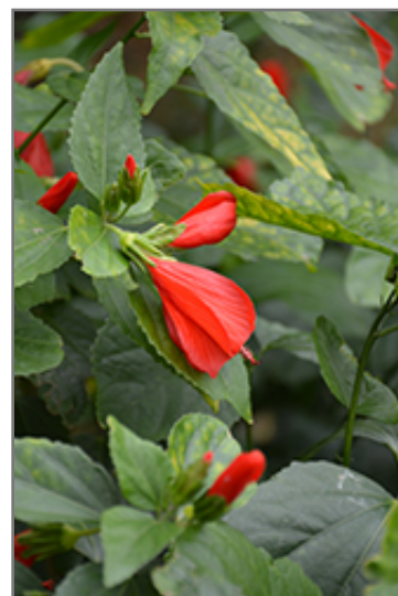
Giant Red Turk's Cap flowers