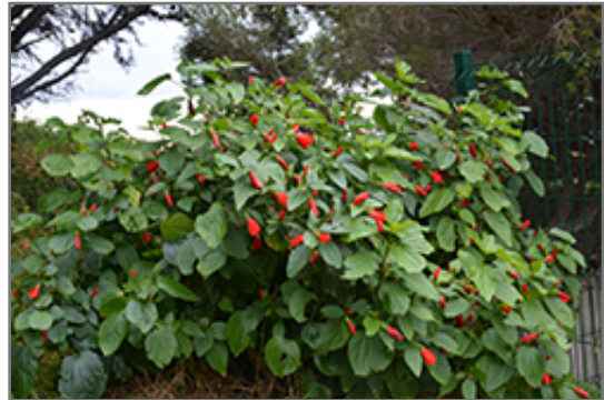
Giant Red Turk's Cap in bloom

This plant should only be grown in full sunlight. It prefers to grow in average to moist conditions, and shouldn't be allowed to dry out. It is not particular as to soil type or pH. It is highly tolerant of urban pollution and will even thrive in inner city environments. This species is not originally from North America.