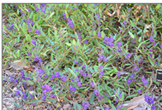
Mini Haha Dwarf Purple Vine Lilac in bloom