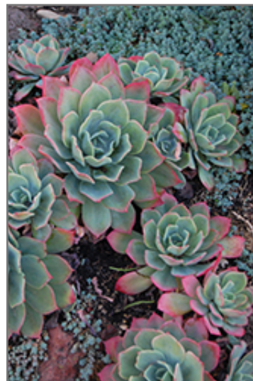
Blue Mist Echeveria

Blue Mist Echeveria is recommended for the following landscape applications;