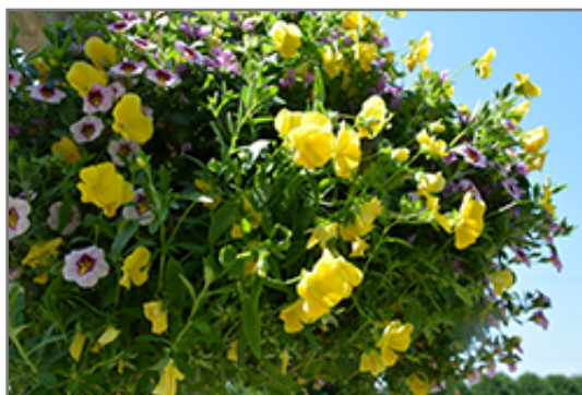
Anytime Sunlight Pansiola flowers