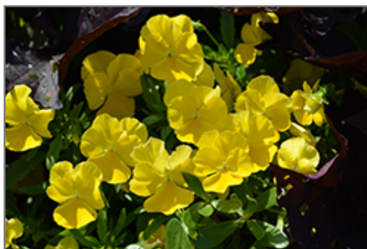
Anytime Sunlight Pansiola flowers

Anytime Sunlight Pansiola is recommended for the following landscape applications;