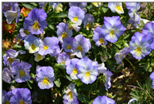
Anytime Quartz Pansiola flowers