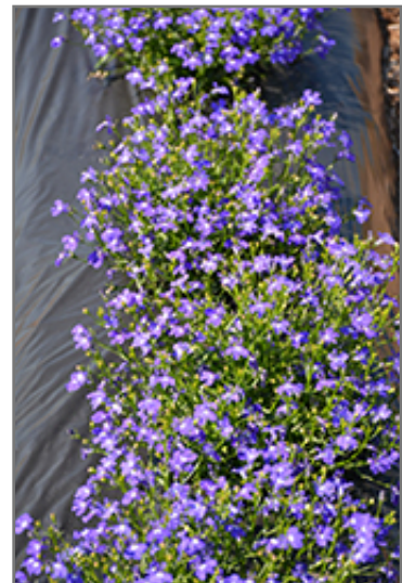
Lobelix Blue Lobelia in bloom