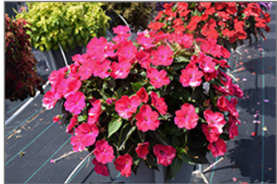
SunPatiens Compact Rose Glow New Guinea Impatiens in bloom

SunPatiens Compact Rose Glow New Guinea Impatiens is a fine choice for the garden, but it is also a good selection for planting in outdoor containers and hanging baskets. It can be used either as 'filler' or as a 'thriller' in the 'spiller-thriller-filler' container combination, depending on the height and form of the other plants used in the container planting. It is even sizeable enough that it can be grown alone in a suitable container. Note that when growing plants in outdoor containers and baskets, they may require more frequent waterings than they would in the yard or garden.