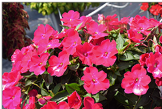
SunPatiens Compact Rose Glow New Guinea Impatiens flowers

SunPatiens Compact Rose Glow New Guinea Impatiens is recommended for the following landscape applications;