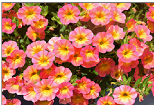
Superbells Coral Sun Calibrachoa flowers

Superbells Coral Sun Calibrachoa is recommended for the following landscape applications;