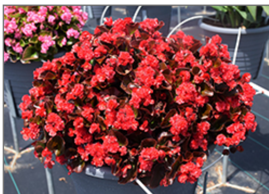
Double Up Red Begonia in bloom