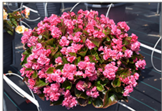
Double Up Pink Begonia in bloom