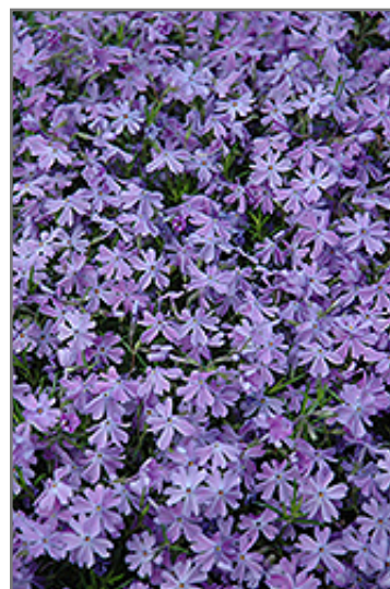
Emerald Blue Moss Phlox flowers