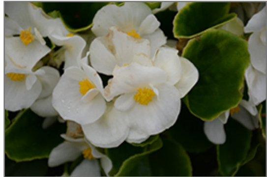
Sprint Plus White Begonia flowers