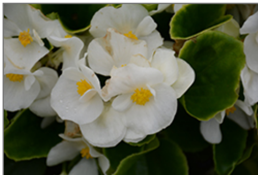
Sprint Plus White Begonia flowers