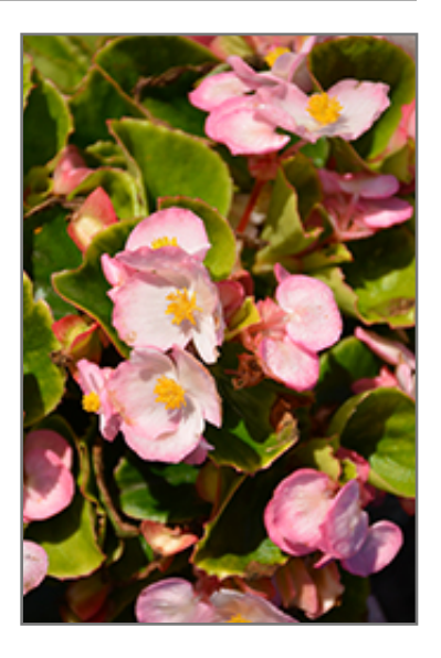
Sprint Plus Apple Blossom Begonia flowers