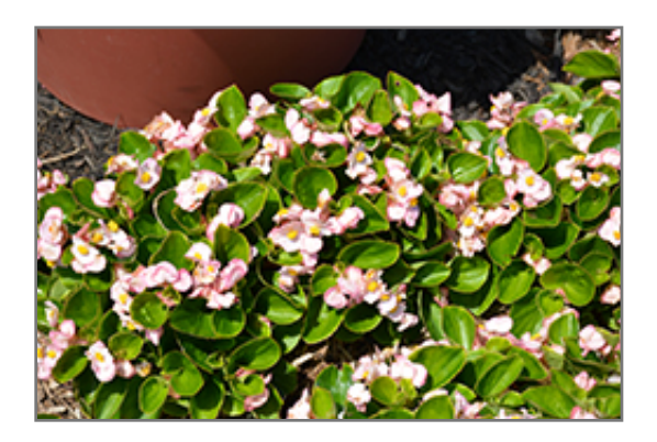
Sprint Plus Apple Blossom Begonia in bloom