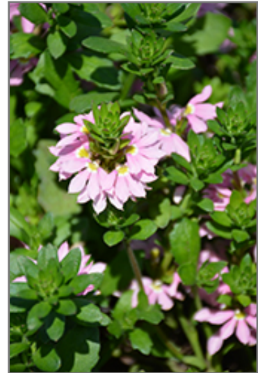
Scampi Pink Fan Flower flowers