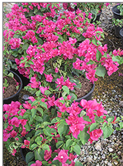
La Jolla Bougainvillea in bloom