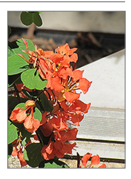
Red Bauhinia flowers

Red Bauhinia is recommended for the following landscape applications;