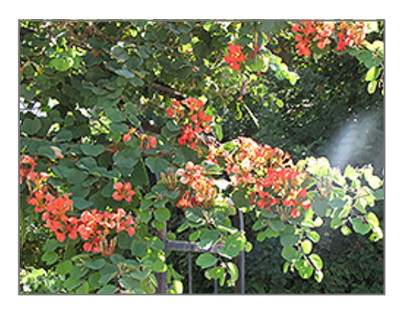
Red Bauhinia in bloom