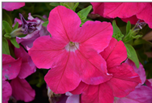
Success! HD Pink Petunia flowers