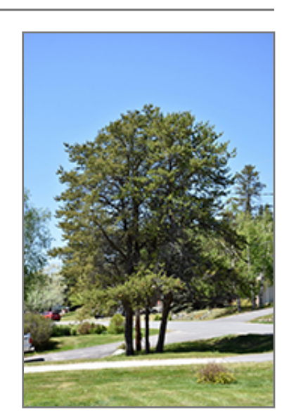
Jack Pine

Jack Pine will grow to be about 45 feet tall at maturity, with a spread of 35 feet. It has a low canopy with a typical clearance of 4 feet from the ground, and should not be planted underneath power lines. It grows at a slow rate, and under ideal conditions can be expected to live for 80 years or more.