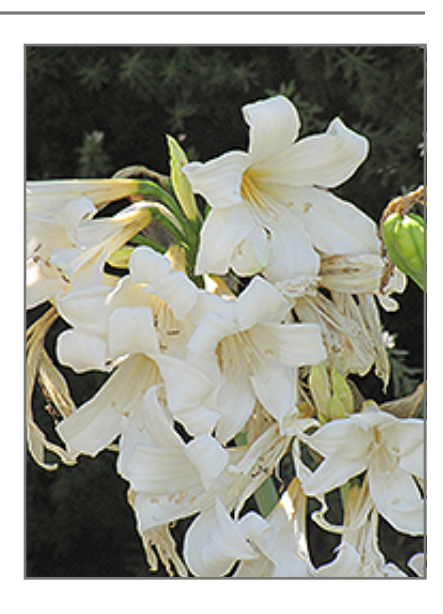
White Belladonna Lily flowers