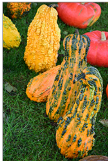
Lunch Lady Gourd fruit