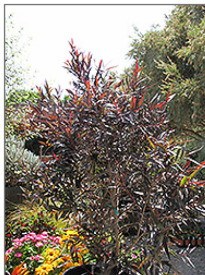
Aftershock Agonis