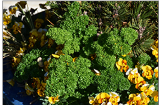
Krausa Parsley

This plant is typically grown in a designated herb garden. It does best in full sun to partial shade. It does best in average to evenly moist conditions, but will not tolerate standing water. It is not particular as to soil pH, but grows best in rich soils. It is highly tolerant of urban pollution and will even thrive in inner city environments. This is a selected variety of a species not originally from North America.