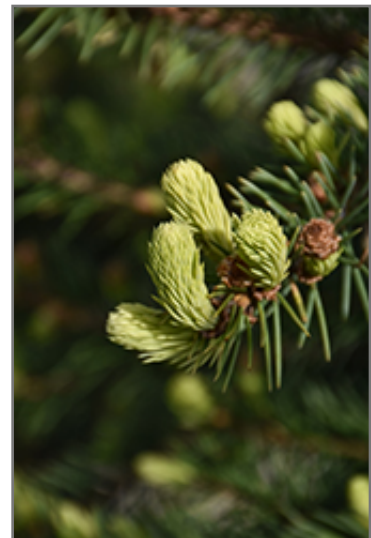
Candlelight Alberta Spruce in spring