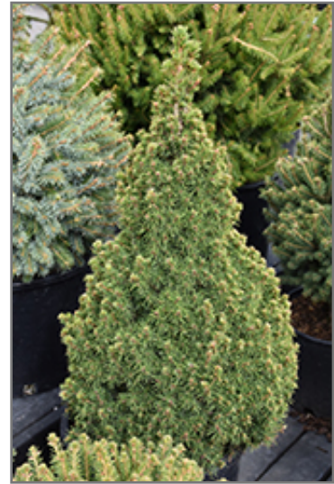
Candlelight Alberta Spruce