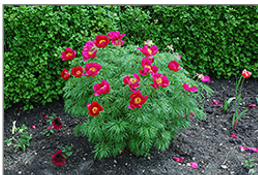
Fernleaf Peony in bloom