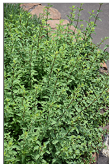
Hopley's Oregano