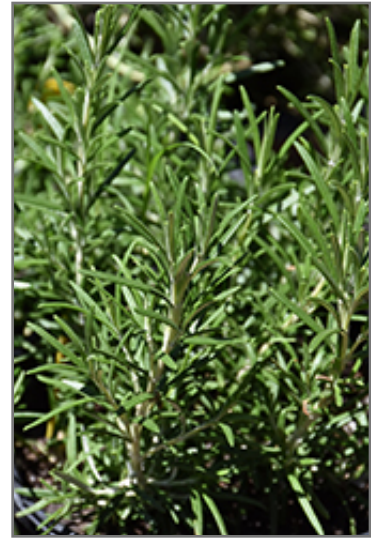
Hill Hardy Rosemary foliage

Hill Hardy Rosemary will grow to be about 4 feet tall at maturity, with a spread of 3 feet. When grown in masses or used as a bedding plant, individual plants should be spaced approximately 24 inches apart. Although it's not a true annual, this slow-growing plant can be expected to behave as an annual in our climate if left outdoors over the winter, usually needing replacement the following year. As such, gardeners should take into consideration that it will perform differently than it would in its native habitat.