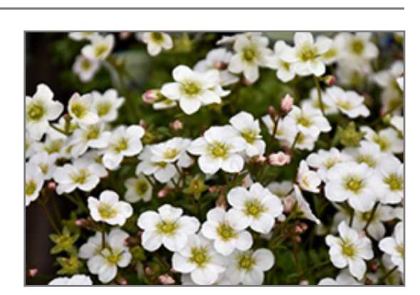
Alpino Early White Saxifrage flowers