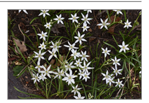
Garden Star Of Bethlehem flowers