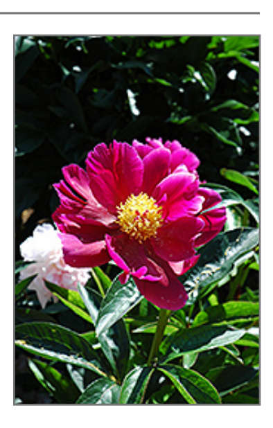
President Lincoln Peony flowers

President Lincoln Peony will grow to be about 30 inches tall at maturity, with a spread of 3 feet. When grown in masses or used as a bedding plant, individual plants should be spaced approximately 30 inches apart. The flower stalks can be weak and so it may require staking in exposed sites or excessively rich soils. It grows at a slow rate, and under ideal conditions can be expected to live for approximately 20 years. As an herbaceous perennial, this plant will usually die back to the crown each winter, and will regrow from the base each spring. Be careful not to disturb the crown in late winter when it may not be readily seen!