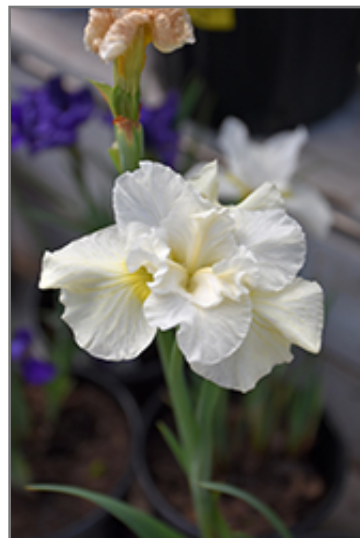
Swallowtail Siberian Iris flowers

A lovely variety producing elegant cream flowers with butter yellow flares; massed plantings give the best effect in a garden; blooms from late spring into the summer; best in full sun and moist soil, but very adaptable