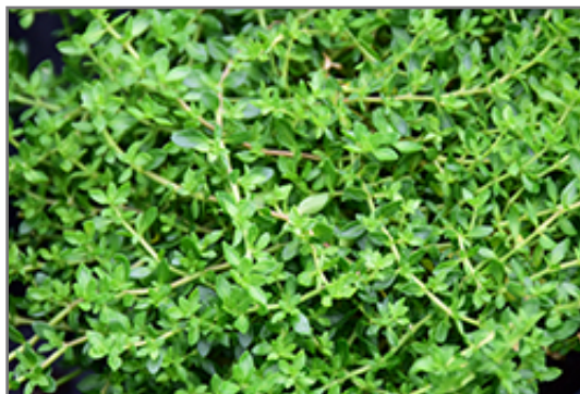
Rupturewort foliage

Rupturewort is recommended for the following landscape applications;