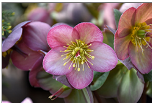
FrostKiss Cheryl's Shine Hellebore flowers

FrostKiss Cheryl's Shine Hellebore is recommended for the following landscape applications;