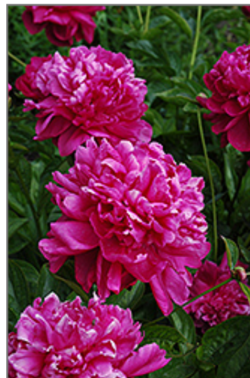
Music Man Peony flowers