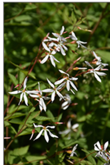
Bowman's Root flowers

Bowman's Root is recommended for the following landscape applications;