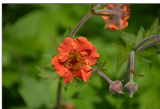
Rustico Orange Avens flowers