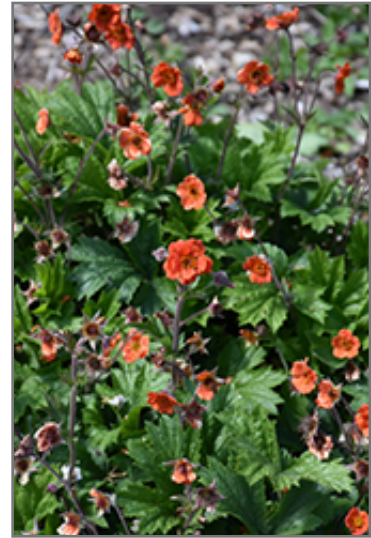
Rustico Orange Avens flowers

Rustico Orange Avens will grow to be about 9 inches tall at maturity, with a spread of 14 inches. When grown in masses or used as a bedding plant, individual plants should be spaced approximately 12 inches apart. Its foliage tends to remain low and dense right to the ground. It grows at a fast rate, and under ideal conditions can be expected to live for approximately 3 years. As an herbaceous perennial, this plant will usually die back to the crown each winter, and will regrow from the base each spring. Be careful not to disturb the crown in late winter when it may not be readily seen!