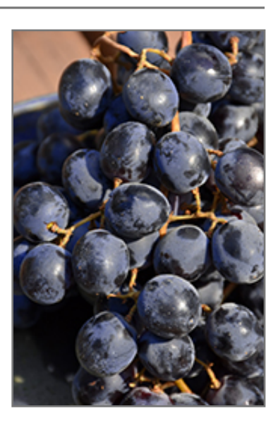
Glenora Grape fruit

Aside from its primary use as an edible, Glenora Grape is sutiable for the following landscape applications;