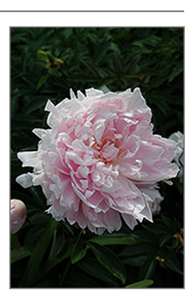
Dolorodell Peony flowers

Dolorodell Peony will grow to be about 30 inches tall at maturity, with a spread of 3 feet. When grown in masses or used as a bedding plant, individual plants should be spaced approximately 30 inches apart. The flower stalks can be weak and so it may require staking in exposed sites or excessively rich soils. It grows at a slow rate, and under ideal conditions can be expected to live for approximately 20 years. As an herbaceous perennial, this plant will usually die back to the crown each winter, and will regrow from the base each spring. Be careful not to disturb the crown in late winter when it may not be readily seen!