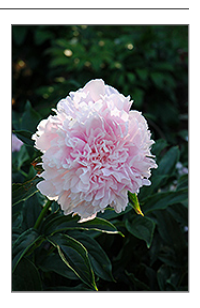
Dinner Plate Peony flowers

Dinner Plate Peony will grow to be about 30 inches tall at maturity, with a spread of 3 feet. When grown in masses or used as a bedding plant, individual plants should be spaced approximately 30 inches apart. The flower stalks can be weak and so it may require staking in exposed sites or excessively rich soils. It grows at a slow rate, and under ideal conditions can be expected to live for approximately 20 years. As an herbaceous perennial, this plant will usually die back to the crown each winter, and will regrow from the base each spring. Be careful not to disturb the crown in late winter when it may not be readily seen!