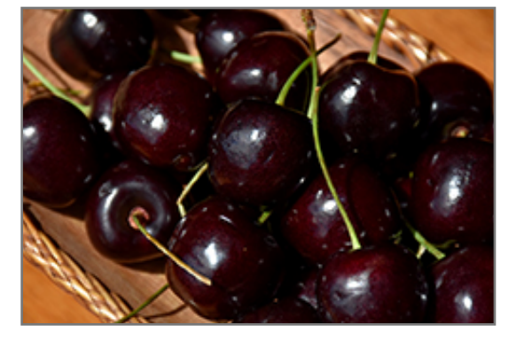
Black Tartarian Cherry fruit