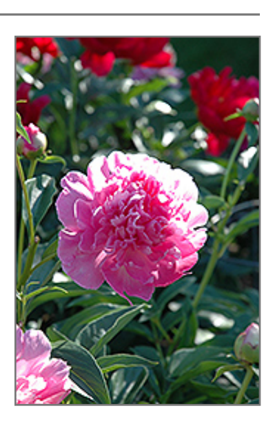
Bouquet Perfect Peony flowers

Bouquet Perfect Peony will grow to be about 24 inches tall at maturity, with a spread of 30 inches. When grown in masses or used as a bedding plant, individual plants should be spaced approximately 26 inches apart. The flower stalks can be weak and so it may require staking in exposed sites or excessively rich soils. It grows at a slow rate, and under ideal conditions can be expected to live for approximately 20 years. As an herbaceous perennial, this plant will usually die back to the crown each winter, and will regrow from the base each spring. Be careful not to disturb the crown in late winter when it may not be readily seen!