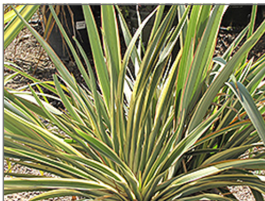
Tricolor New Zealand Flax