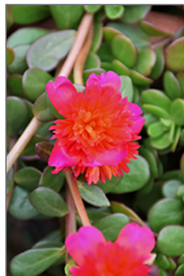
ColorBlast Double Magenta Portulaca flowers

ColorBlast Double Magenta Portulaca is recommended for the following landscape applications;