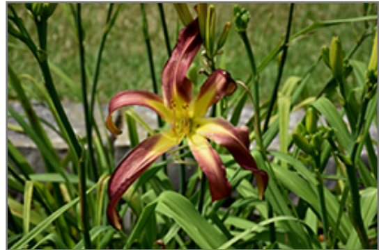
Red Zeppelin Daylily flowers