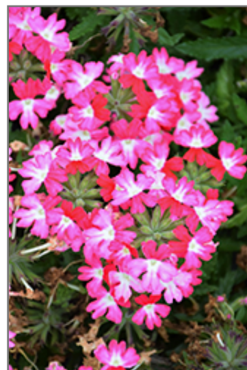
Hurricane Hot Pink Verbena flowers