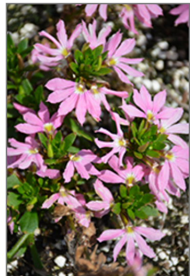
Surdiva Classic Pink Fan Flower flowers