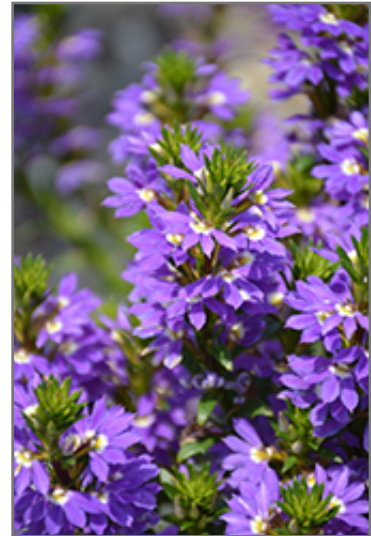
Purple Haze Fan Flower flowers