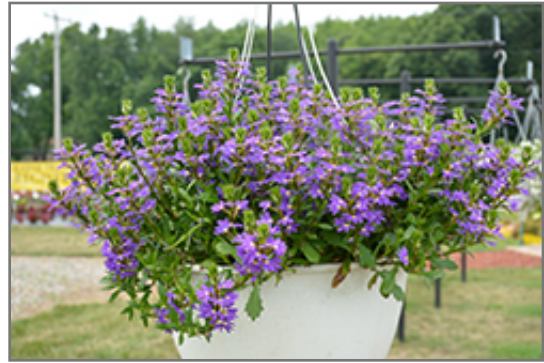
Purple Haze Fan Flower in bloom

Purple Haze Fan Flower is a fine choice for the garden, but it is also a good selection for planting in outdoor containers and hanging baskets. It is often used as a 'filler' in the 'spiller-thriller-filler' container combination, providing a mass of flowers against which the larger thriller plants stand out. Note that when growing plants in outdoor containers and baskets, they may require more frequent waterings than they would in the yard or garden.