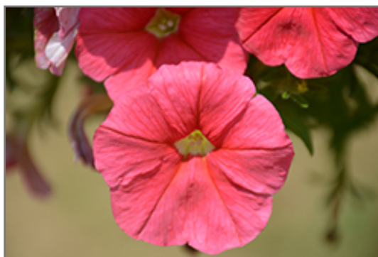
Sanguna Patio Salmon Petunia flowers