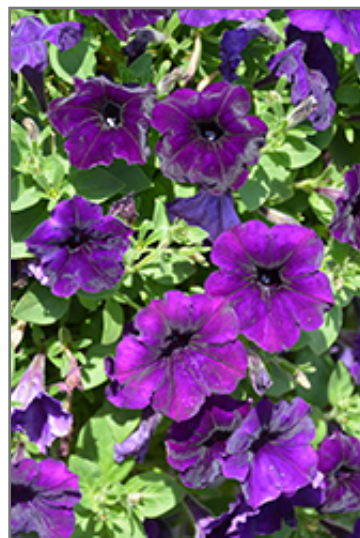
Sanguna Patio Blue Petunia flowers